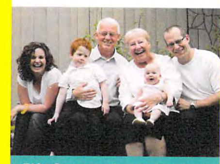
It's for people of all ages!