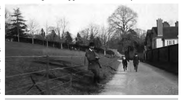
Where's this? Turn over and read all about it . .

The town council also put forward requests to the county to consider lower speed limits in some residential areas, the future of the town bus and ways in which town centre parking can be managed without charging town centre users.