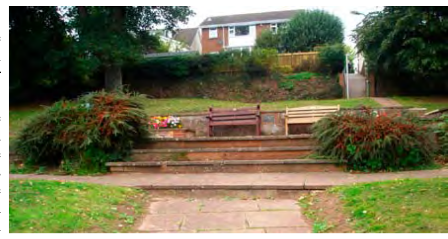
The Scout memorial gardens in 2010 - in need of tlc

Although the gardens themselves were quite modest in scale, restoration of hard landscaping is expensive and at the same time, the council was keen to improve access for all potential visitors to the park. The amount of funding required was far beyond the usual budget of the council and financial support was sought from a variety of sources including the county and district councils.