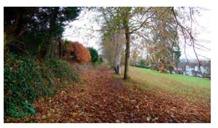
The surface of the path that runs behind the line of mature trees will be improved with a layer of bark chippings

Some time ago the council commissioned an arboriculturist's report on the condition of the trees in the park. Most of the trees along the top path are very mature and reaching the end of their normal life span. Some of the mature limes are in need of treatment or replacement in order to maintain the original line. Further works are needed to improve the condition of other trees in the park and the working group has recommended future planting and replacement of specimens.