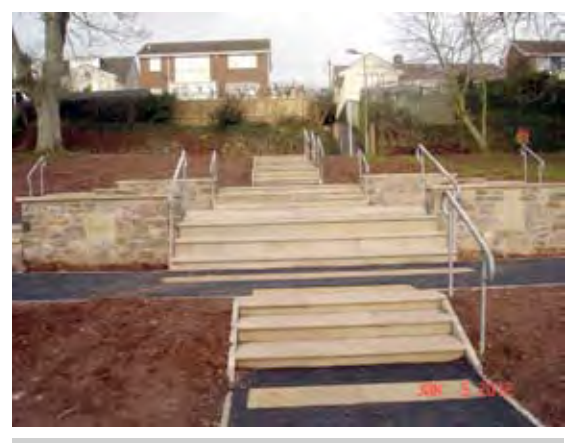
The project in progress, January 2012