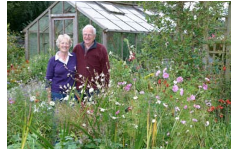
Two of the Floral Crediton Garden competition prize-winners at Barnfield and Fordton.

There have been three major issues for the council over the past few months. The one that seems to have angered the town most is Mid Devon District Council's decision to dramatically change the Lord's Meadow Leisure Centre. The town council objected on behalf of the town because councillors felt there had been no meaningful consultation. I'm pleased to report that the project is on hold for the moment pending talks with Queen Elizabeth's Community College.