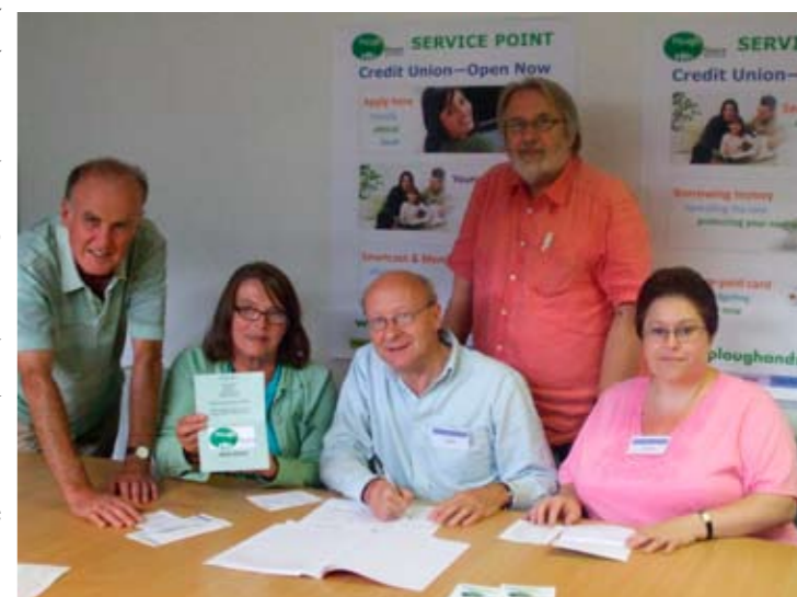
Credit Union volunteers are ready to help anyone needing a loan.