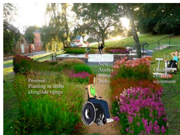
An impression of what the path could look like with planting alongside it.