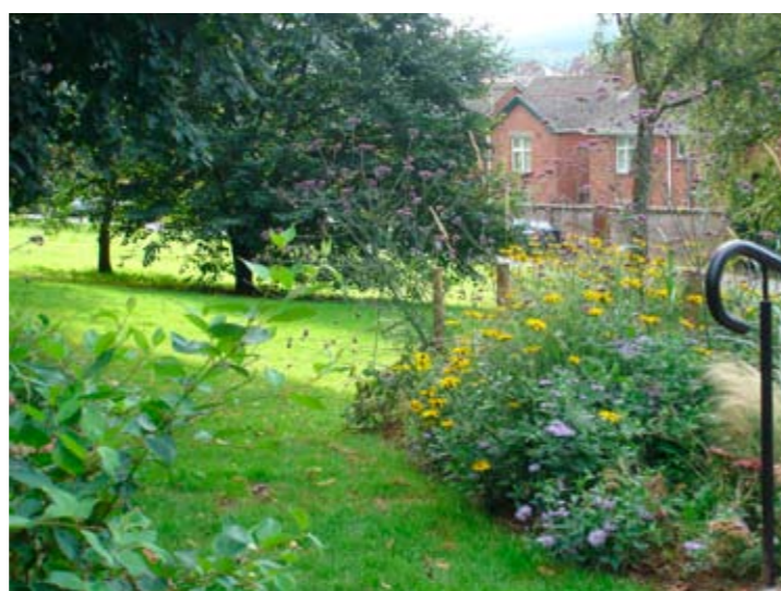
A very small part of the path route has already been planted to give an impression of what the whole area could look like.