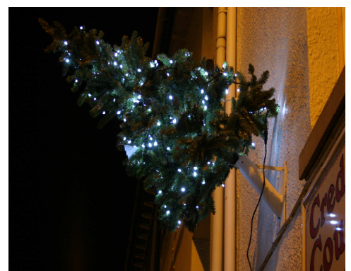
40 lit Christmas trees will decorate the High Street

The town council has been working with the Arts Centre, CREDITON Rotary and CREDITON Courier to improve the Christmas decorative lighting in the High Street and other parts of the town. With financial support from local businesses and funds from the town, district and county councils, the quantity and quality of decorative lighting is getting a significant upgrade. The committee has invested in artificial trees supplied with LED lights which can be re-used in following years and added to with additional trees and lights. From the late November switch-on to mid December, there will be late-night shopping evenings, music and entertainment events to get the festive season in CREDITON off to a sparkling start. See the last page for dates.