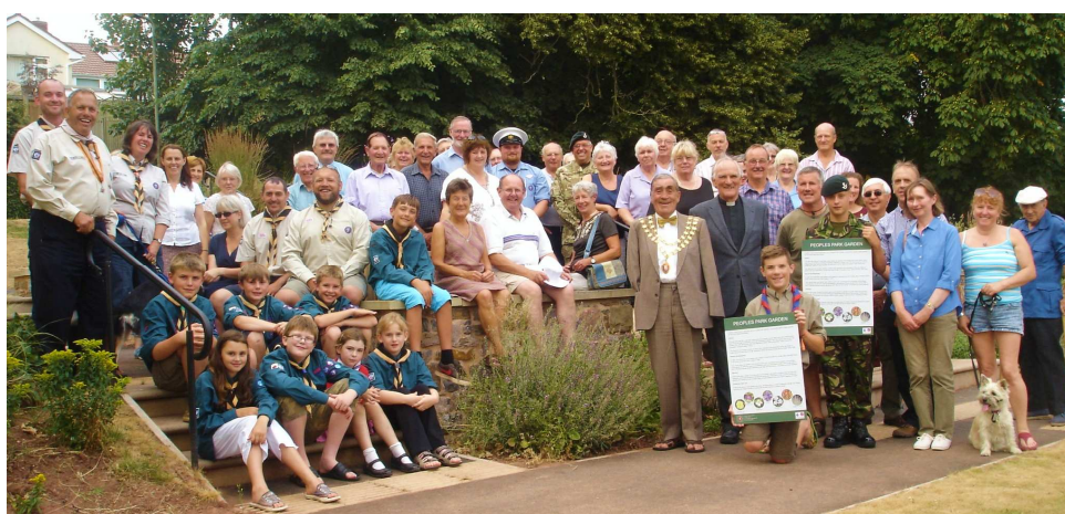
The Scout Memorial garden was formally opened in July