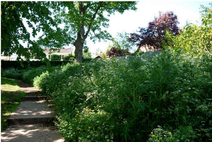
A neglected area in need of transformation