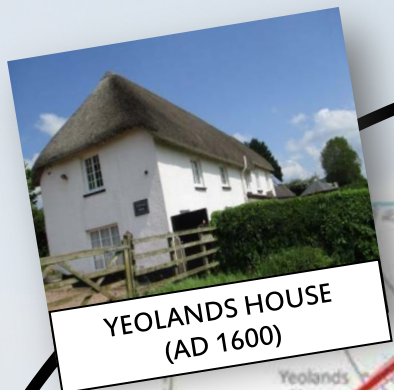
YEOLANDS HOUSE (AD 1600)