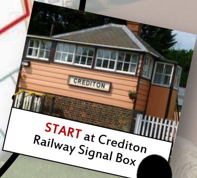
START at Crediton Railway Signal Box