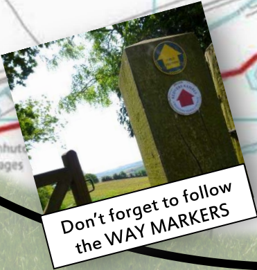
Don't forget to follow the WAY MARKERS