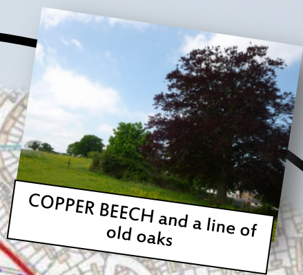
COPPER BEECH and a line of old oaks