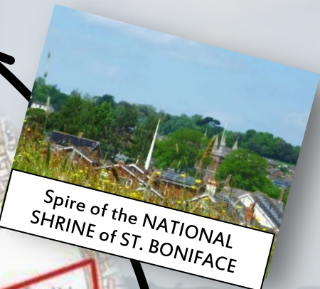
Spire of the NATIONAL SHRINE of ST. BONIFACE