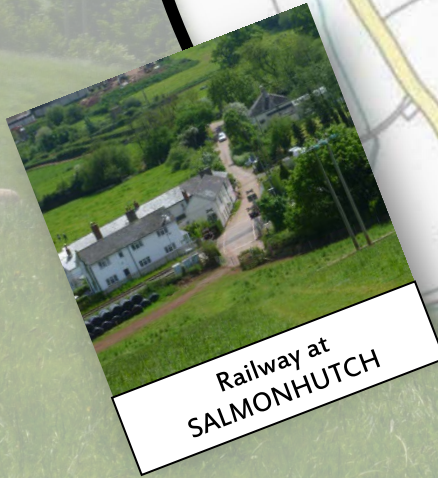
Railway at SALMONHUTCH