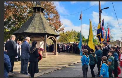
Remembrance Sunday 2022