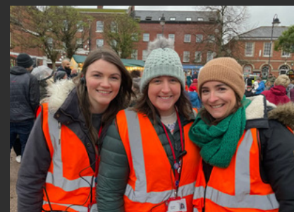
Christmas in Crediton 2022