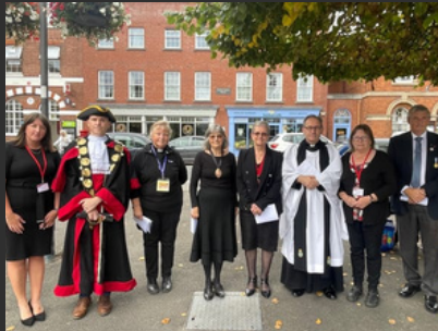
The Proclamation of the Accession