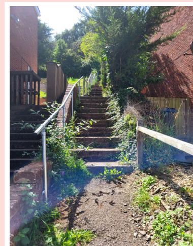
Newly installed handrail

The Parish Paths Sub-Committee met on two occasions during 2022-23. The sub-committee discusses any issues that arise regarding paths around the town and ensures these paths are walked at least once a year to check they are safe, reporting any issues to Devon County Council. This year has seen the approval of a handrail at the bottom of the steps leading from Stonypark down into Greenway. It has been noted that a new footpath (yet to be adopted) now links Tarka Way to Downeshead Lane. If you take the new path from Downes Close, a lovely view of the town can be observed half way along this route.