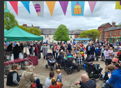
Coronation of King Charles III