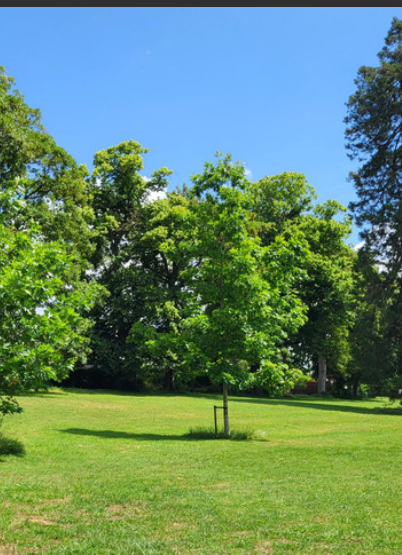
Peoples Park - long grass areas introduced to improve biodiversity

Hello to Spring 2022! Goodbye to restrictions on meetings and gatherings! It gave the Crediton community the opportunity to come together to celebrate the Jubilee of HM Queen Elizabeth II in June, to mourn her passing and mark the Succession in September and to celebrate again for the Coronation of King Charles III in May. The public commemorations and celebrations in Crediton, organised by the town council, were attended by hundreds of residents taking part in these very significant events of our time.