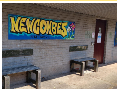
Graffiti project at Newcombes toilets

Sustainability, climate change and the need to re-establish biodiversity are now significant factors in our policy and decision making. Fewer cuts to Peoples Park and verges give more opportunity for wildflowers and insects, is cheaper and has less environmental impact. Bed and container planting is chosen for its suitability for pollinators and drought tolerance.