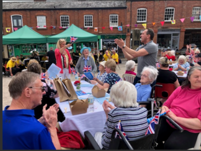
Jubilee Celebrations 2022