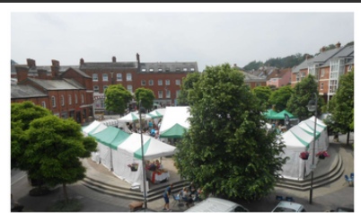
Crediton Neighbourhood Plan 2018-2033 Made October 2022