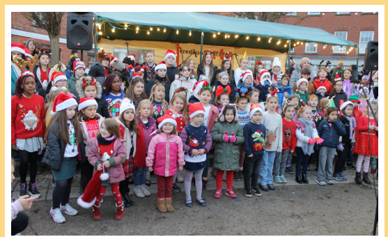
School choirs 2023

Now, our staff are so familiar with the requirements of the event – including road closures, first aid, marshalls and stewards, food stalls, entertainment, the parade, Father Christmas, gazebos, the lost children point and safeguarding – that we no longer need a committee to organise it. It has become part of business as usual for the staff team and it's more efficient to let them get on with it. In 2023 school choirs, Morris dancers, adult choirs, musicians and performers entertained the crowds for the afternoon before the parade entered the square in the early evening, Father Christmas appeared and the lights went on. There's a predictability about Christmas. We all know what the key ingredients are and it will all happen again this year. We do like surprises though, so you can expect us to ring the changes now and then.