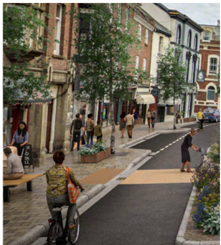
CGI image of what the High Street could look like

Alongside that, we have commented on Mid Devon District Council's Crediton Town Centre Masterplan and joined district councillors and officers to discuss issues included in the proposals. Of course, the amount and speed of traffic in the High Street affects the air quality, footfall, ambience and usability of the High Street as our principal shopping area. If there were an easy solution it would have been dealt with years ago. Changing the nature of the traffic is a significant challenge to which we still don't have an agreed and achievable answer – we're still looking for one, though.