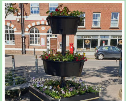
Town Square flower towers

In addition, sponsorship was secured with 4 businesses around the Town Square, in the form of watering the flower towers once/per week. Finally, the Committee made the decision to move away from the usual hanging basket displays and this year focused on perennials and grasses which are pollinator and insect friendly. Not only will these be beneficial for biodiversity, but these plants will only need watering once per week, which will halve the watering costs. Also, with the climate emergency in mind, the total journeys made to Crediton by the contractor will be significantly reduced.