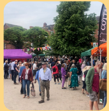
Food Festival 2023

Our year is starting to develop a regular rhythm of community events alongside the 'business as usual' operations run by our small team of staff. The Food Festival reappeared in June 2023 – held for the first time since 2018 (circumstances and Covid interrupted the continuum). It was hard work for the Food Festival committee to get the event going again but the council was pleased to support with funds, road closures, resources and event management. It was a very welcome return for this well-supported event.