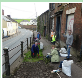
[CUT!] on Exeter Road

Crediton Urban Taskforce [CUT!] was formed following the activity and expertise of a small group of volunteers. [CUT!] is a volunteer-led initiative, supported by Crediton Town Council. The group aims to tackle the maintenance of our pavements, kerbs, paths and other public areas due to service cuts by Devon County Council and Mid Devon District Council. Further information can be found on our website under the Facilities tab.