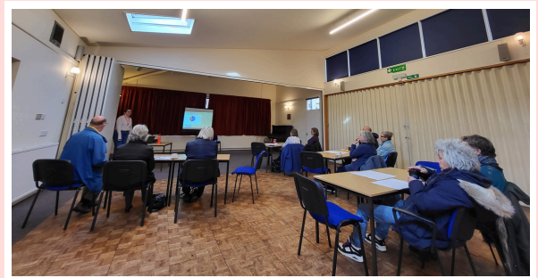
Budget workshops 2023

There are many moving parts on differing timelines all with the same aim of promoting Crediton and making it a better environment for its residents, businesses and organisations.