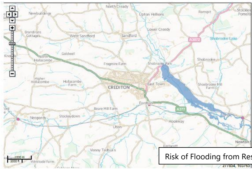
Risk of Flooding from Reservoirs