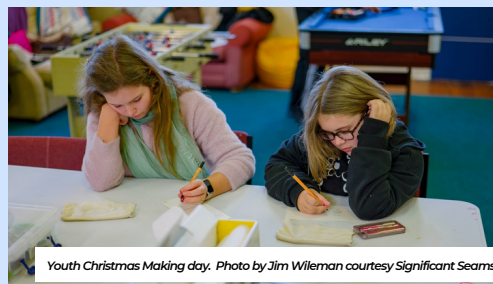
Youth Christmas Making day.