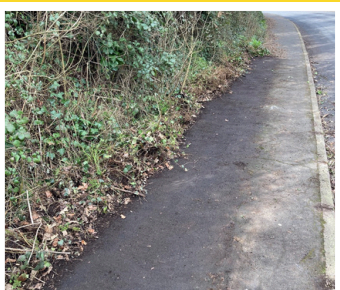
[CUT!] action day on Jockey Hill

Please contact the town council's Deputy Clerk for information on how you can get involved with [CUT!] by emailing reception@crediton.gov.uk . You can also scan the QR code to visit the [CUT!] webpage, view the full list of scheduled action days and join our mailing list.