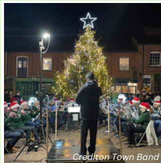
Crediton Town Band

After careful deliberation, the Grants Sub-Committee approved a sum of £32,600 for community grants.